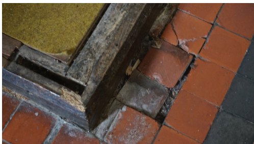
Broken and uneven flooring, which needs replacing